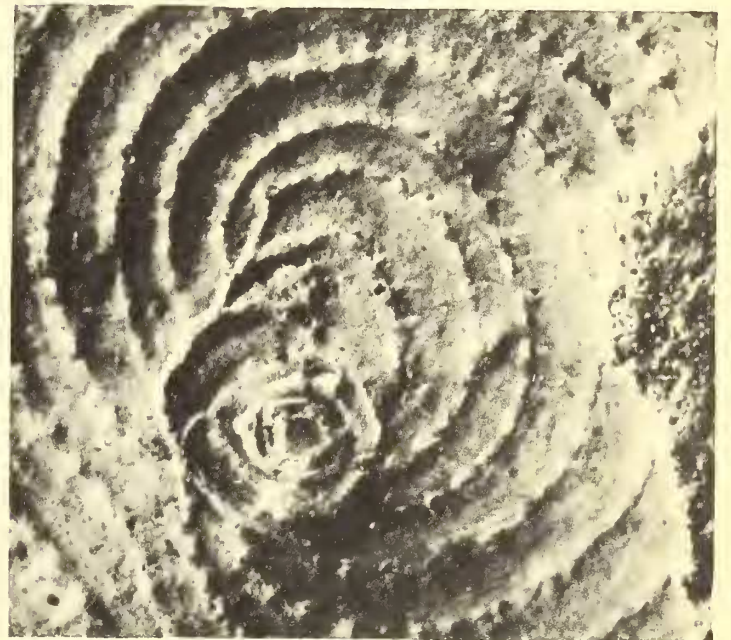
4 1 mm.